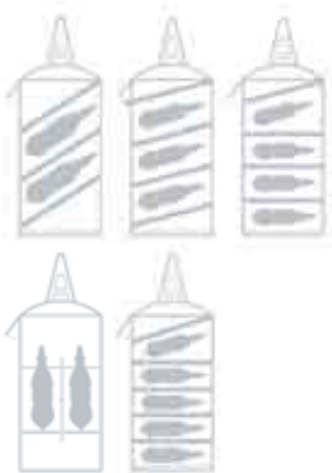
Typical partition layouts of HB610